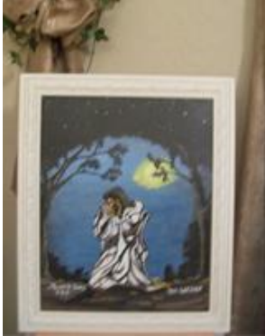
The Garden 16"x20" A Children's favorite

Original acrylic painting White designed wooden fame Special Discounted Price: $114.95 (S&H included)